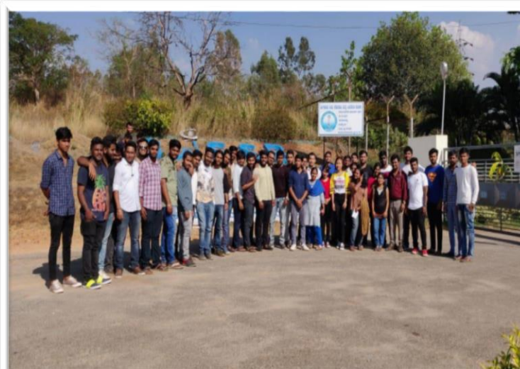
Students of 6 th A section on 6 th March 2019 @ TK Halli

Industrial trip was organised by Department of Civil Engineering for Third Year students on 6 th and 13th Mar 2019. They visited “BWSSB Water Purification Plant at TK Halli. Malavalli Taluk, Mandya. students learnt to identify the level of impurities in water, About formation of layout of the plant, to identify the level of Chlorine (CL 2 ) in the portable water, About technology adoption (Pulsification and DAF ) for better water treatment.