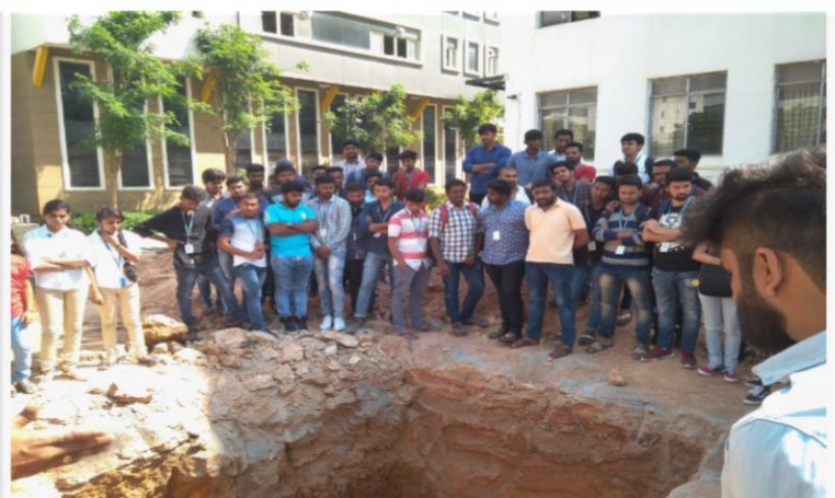
Students of 6 th A section on 19 th March 2019

Industrial trip was organised by Department of Civil Engineering for Third Year students on 19 th Mar 2019. They were taken to “Extension of S.V Patel Block Building of New Horizon college of Engineering, Marathalli outer ring road Bengaluru”. The students were able to understand the construction of isolated footing and column, reinforcement laying procedures for the footing and columns.