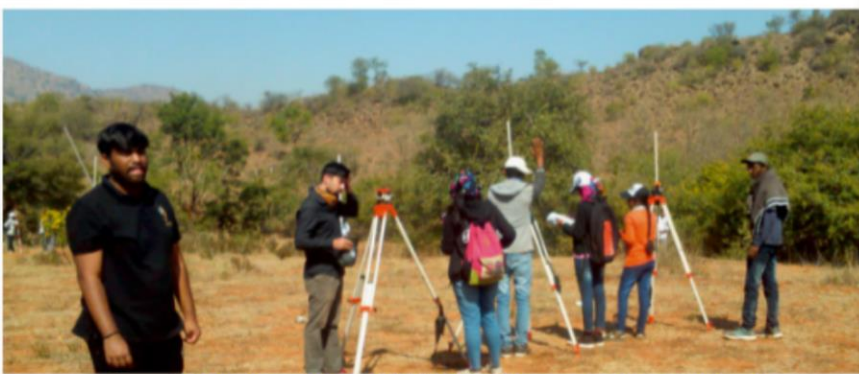
Survey camp 2019 for 6th semester students