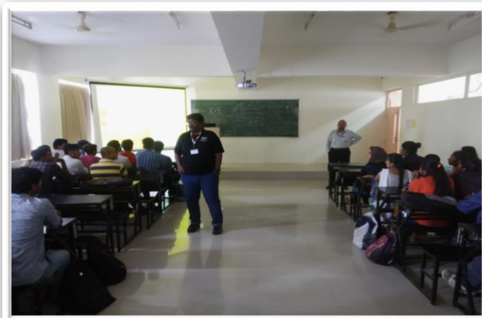
'ISCOT'- application of BIM- Latest trends in Civil Engineering