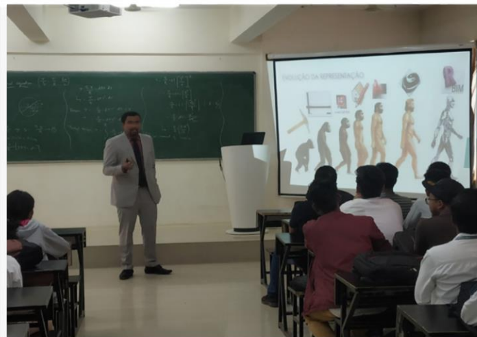
RICS'- Effective use of BIM in Construction Management